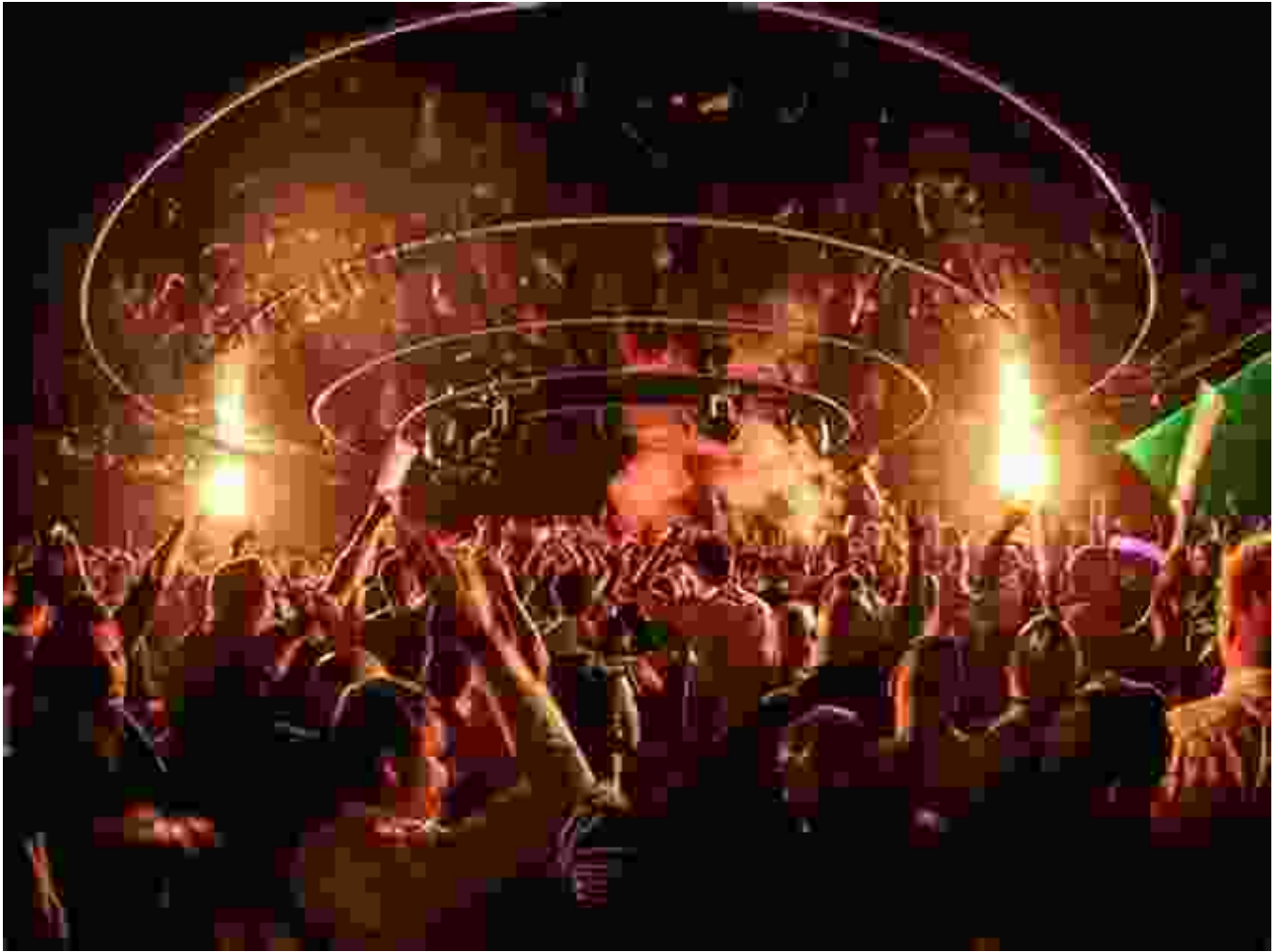
Wide-angle shot capturing the energy and movement of the dance floor.