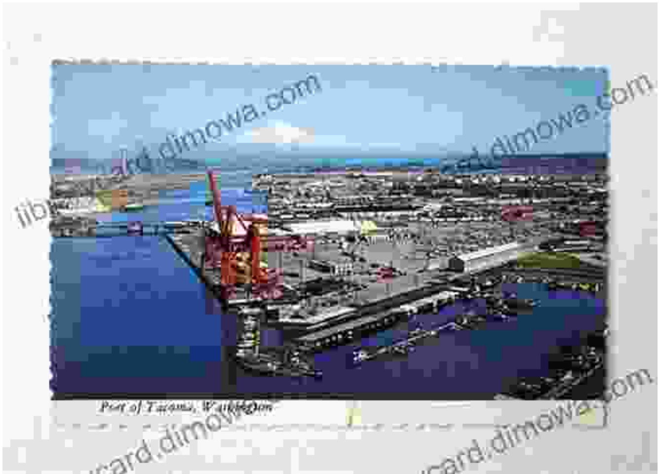
Port of Tacoma, Washington