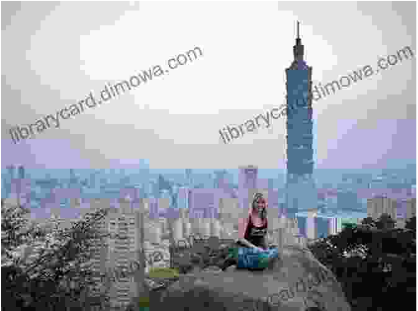
Elephant Mountain, Taipei, as Captured by Suneal Varma