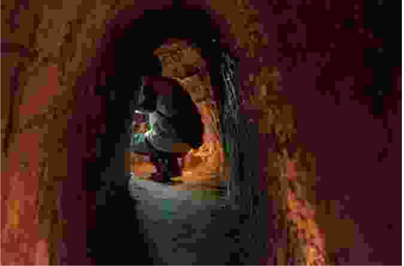
Cu Chi Tunnels