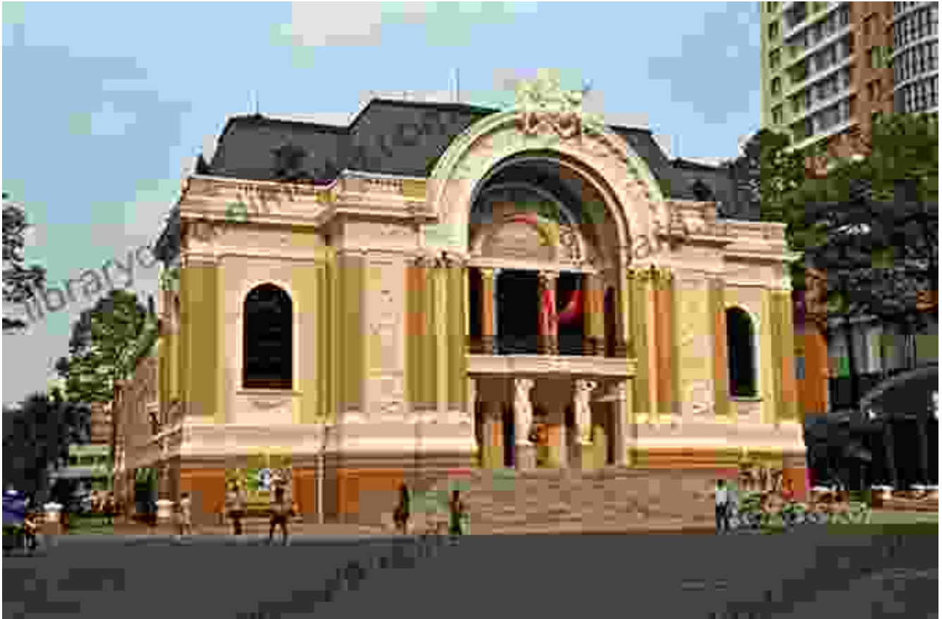
Saigon Opera House