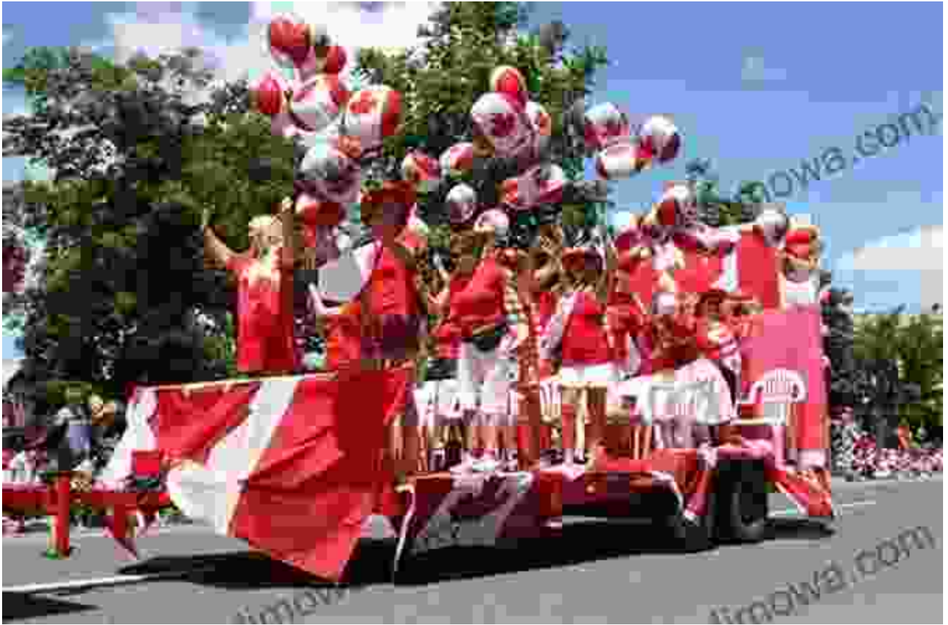
Canada Day Parade, a joyful expression of community pride