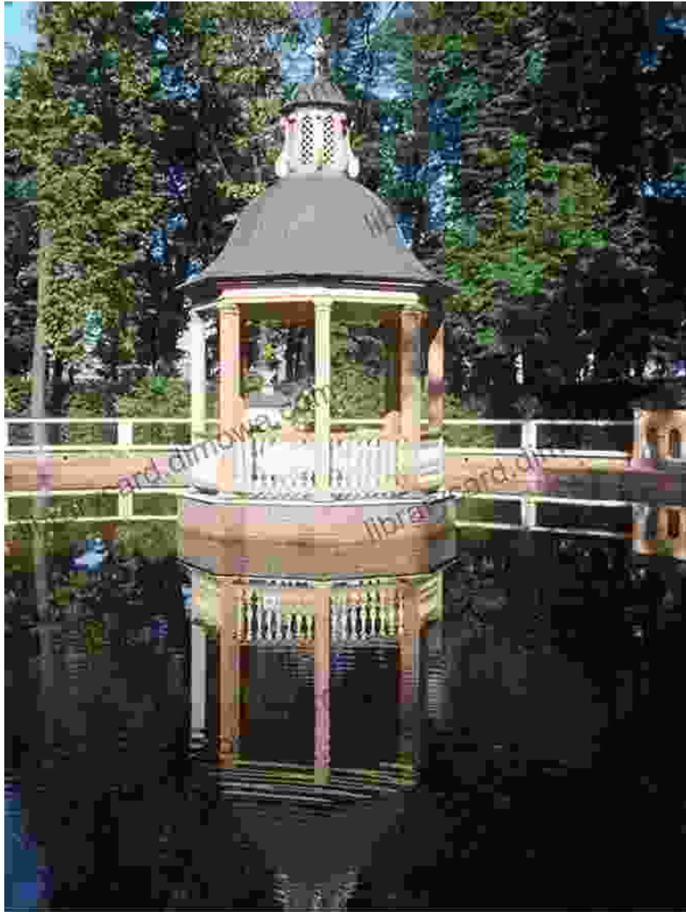
Beaverdams Park, a peaceful oasis in the heart of Lincoln