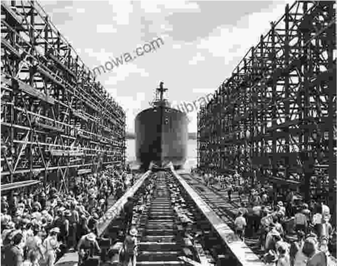
A shipyard in Portland during World War II.