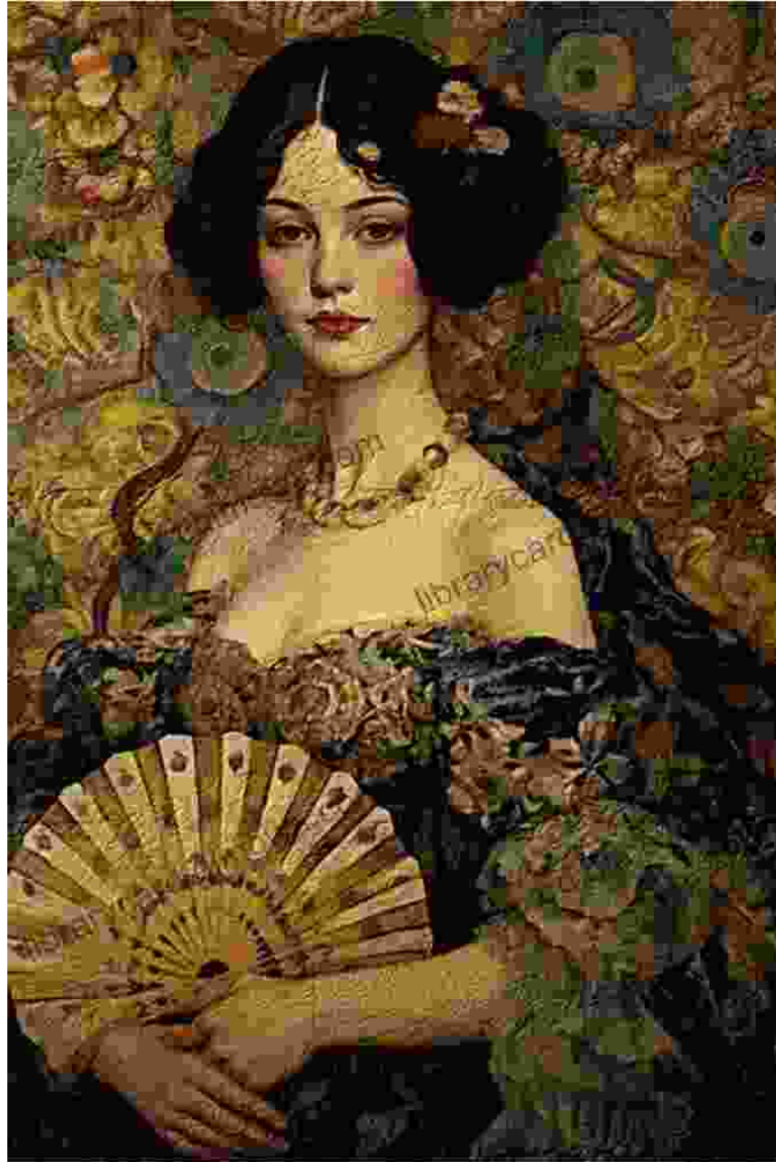
Portrait of a Woman with a Fan (1920)

Vodkin's portraits capture the essence of his subjects, revealing their inner thoughts and emotions with remarkable sensitivity. His use of color and brushstrokes conveys a profound understanding of human nature.