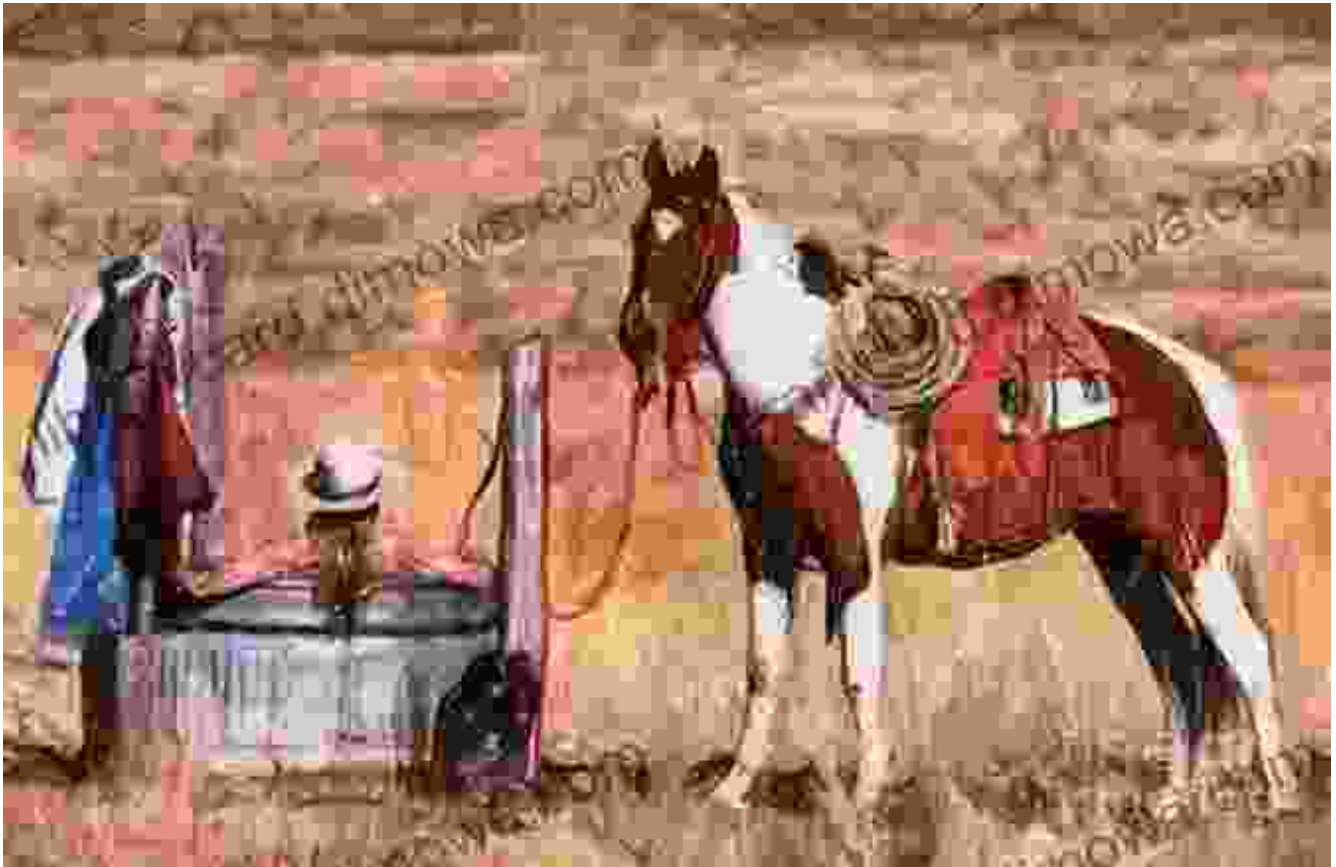
The Bathing of a Red Horse (1912)

This extensive collection of 232 color paintings offers a comprehensive overview of Vodkin's prolific artistic career. Each work is a testament to his remarkable talent and unique artistic vision.